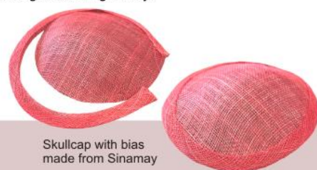
Skullcap with bias made from Sinamay